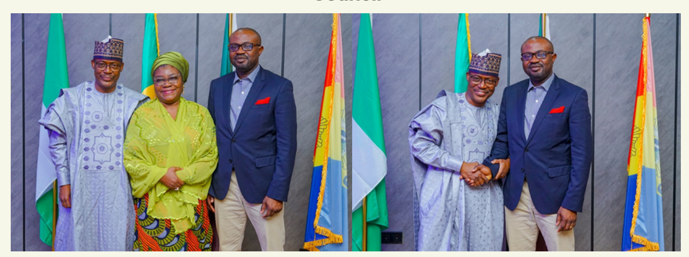
Minister of Interior hosts Acting Executive Secretary of the National Universities Commission (NUC), Chris Maiyaki, to discuss areas of collaboration