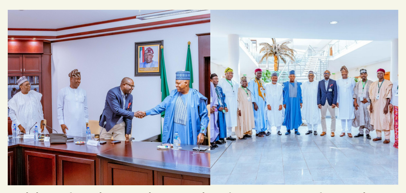
Minister of Interior at the inauguration of the new board of the National Hajj Commission of Nigeria by Vice President Kashim Shettima