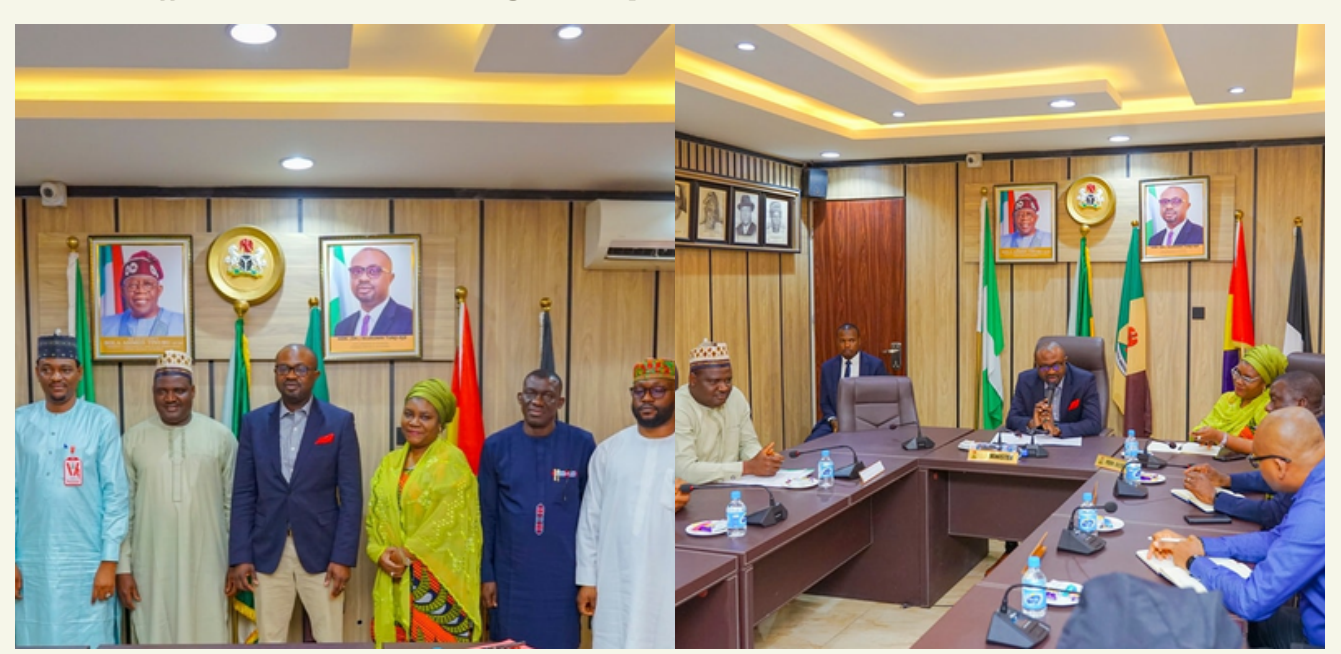
The Minister of Interior hosts the leadership of the Abuja Municipal Area Council